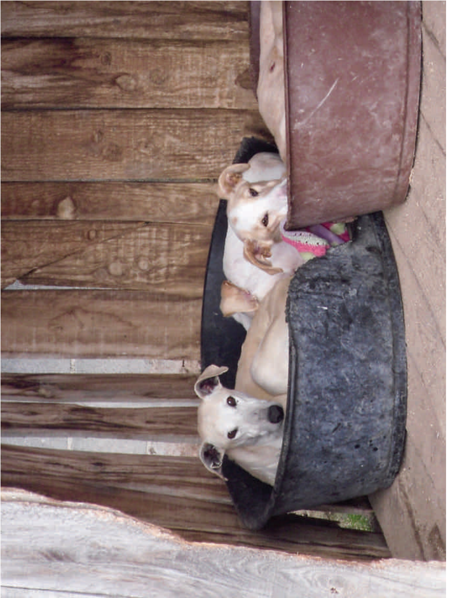
Galgos resting at the Scooby Shelter in Spain. See QCA NEWS.