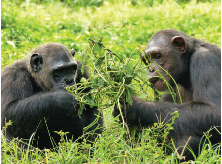
Chimpanzees enjoy plants harvested during the LWC Green Leaf Project

Limbe's Green Leaf Vegetable Scheme focuses on redirecting the women of Batoke, a hunting village located in the buffer zone of Mount Cameroon National Park, from preparing and selling bush meat to sustainably harvesting green leaf vegetables. These vegetables are then purchased as food for the animals cared for at LWC. This programme further decreases the economical need for hunting, as it has no additional cost to participants and is an activity that people traditionally participate in. The Scheme provides essential nutrition for the rescued primates while safeguarding wild populations of vulnerable and critically endangered species living in and around the National Park.